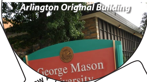
Arlington Original Building

Bookstore • Computer lab Counseling and Psychological Services Graduate student lounges • International Programs and Services • Library • Photo ID School of Public Policy • University Life